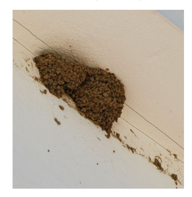
Figure 2. House martin's nest installed on the wires

The overall results show that, despite removing nests and fitting wires as deterrents, house martins try to