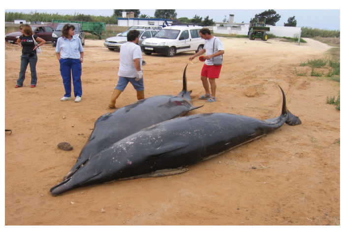
Figure 3. Full view of the two specimens of Mesoplodon bidens stranded in

muscle are kept in the Aula del Mar of Málaga (Spain) under the control of the Consejería de Medio Ambiente de la Junta de Andalucía (Andalusian Government). The Sowerby's beaked whale is a little known species (Ostrom et al., 1993; Hooker & Baird, 1999; McLeod et al., 2004). Specimens of M. bidens live in groups of between 2 and 10 individuals, distributed in the waters of the North Atlantic (Castells & Mayo, 1990). Until 2002 there was no record of this species in the waters of the Mediterranean (Notabartolo, 2002), but it was later reported in the waters of Greece (Frantzis et al., 2003). The only stranding event of this species reported in Spain was a female, on the coast of Santander (northern Spain) in 1980 (Castells & Mayo, 1990). Therefore, the two individuals stranded on the Andalusian coast represent the first record on the Andalusian coast and the second in Spain and, in addition, represent the first case of a multiple strandings of this species in Spain.