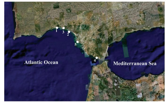
Figure 1. Geographical location of strandings: I Mesoplodon europaeus Huelva 1990; 2 Mesoplodon densirostris Matalascañas 1996; 3 Mesoplodon europaeus (two records) 1997; 4 Mesoplodon densirostris Tarifa 2003; 5 double strandings Mesoplodon bidens Rota 2007.

The other species is the Sowerby's beaked whale (Mesoplodon bidens, Sowerby, 1804), with two individuals stranded together on the coast of Rota (36°37'N 6°22'W, Cadiz Province) on 8 September 2007, which were still fresh (Figure 3), which suggests that they died in the previous 12 hours. They had no external lesion and an in situ necropsy revealed no apparent internal damage. They were two males with total lengths of 480 cm and 435 cm, respectively. Their skeletons are kept in the Vertebrate Collection of the Estación Biológica de Doñana (EBD 28806 and EBD 28807), and samples of skin, fat tissue, and